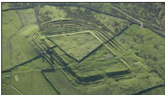
Whitley castle

Alastair continued by describing the topography of Whitley Castle. It is built on top of a slight natural hillock with long defensive views on three sides. The form of the hill made it impossible for the usual playing card shape to be constructed with the result that the plan view resembles a diamond, an extremely rare occurrence almost unknown in the Roman Empire. Nevertheless, the Romans had done their best to stick with the layout of the buildings as they would have been within the usual rectangular shape. There is some suggestion that the hillock may have been an existing Brigantian site, which suited the Roman requirements rather well. Certainly there are many Iron Age and Bronze age farms in the South Tyne Valley, attesting to the long history of settlement. This settlement continued around the fort during the period of Roman rule and local farms must have supplied it with food, willingly or otherwise. Other people, providing services of various kinds, would have been drawn in to the area and the result was a large civilian settlement, or vicus, just outside the military compound.