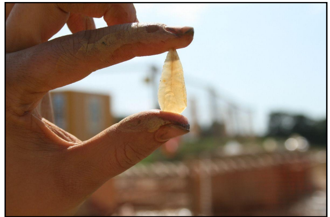
Sunlight through flint arrow-head

Archaeologists working ahead of construction on Carlisle's new CNDR (Carlisle North Development Route) bypass back in 2009 thought that their biggest problem would be finding a way of minimising its impact on the remains of the Roman Wall. The new road crosses the Wall where it runs alongside the south bank of the River Eden. What the archaeologists didn't realise was that they were about to stumble upon one of the largest assemblages of prehistoric remains in the North West!