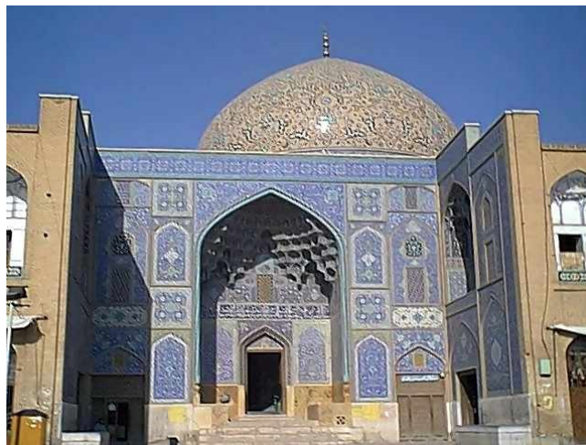
Lotfollah Mosque, Isfahan

The site, which is extensive and dates from around 515 BC, forms a platform on a plain with mountains as a backdrop. Persepolis was the ceremonial capital of the Persian Empire during the Achaemenid dynasty. It is thought that Cyrus the Great chose the site but that Darius the Great, his successor, built the terrace, palaces, military buildings, treasury and reception halls. The city was one of several capitals and would have been visited at different times,